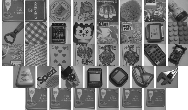
Fig.2. Top: The 31 objects of the scale experiment. Bottom: The 6 different scales